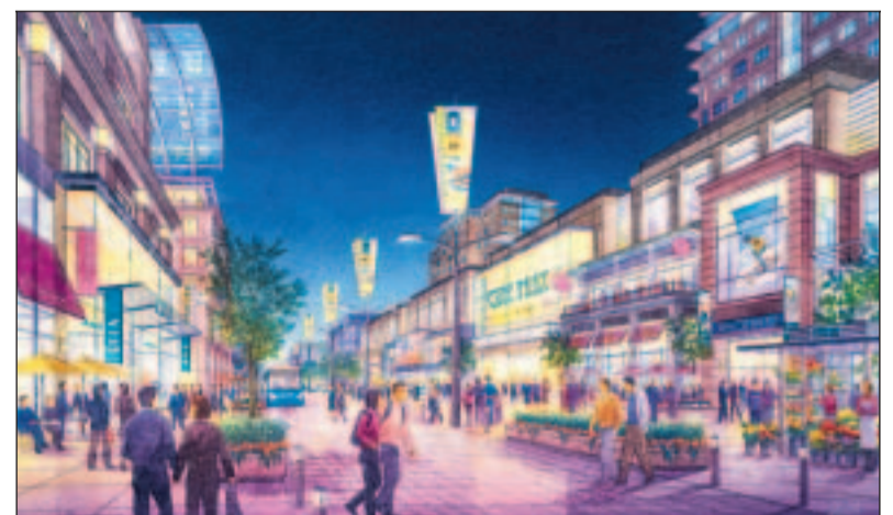
Simcoe Promenade will be an entertainment district and host restaurants, bars, clubs, cinemas, theatres and sporting activities.