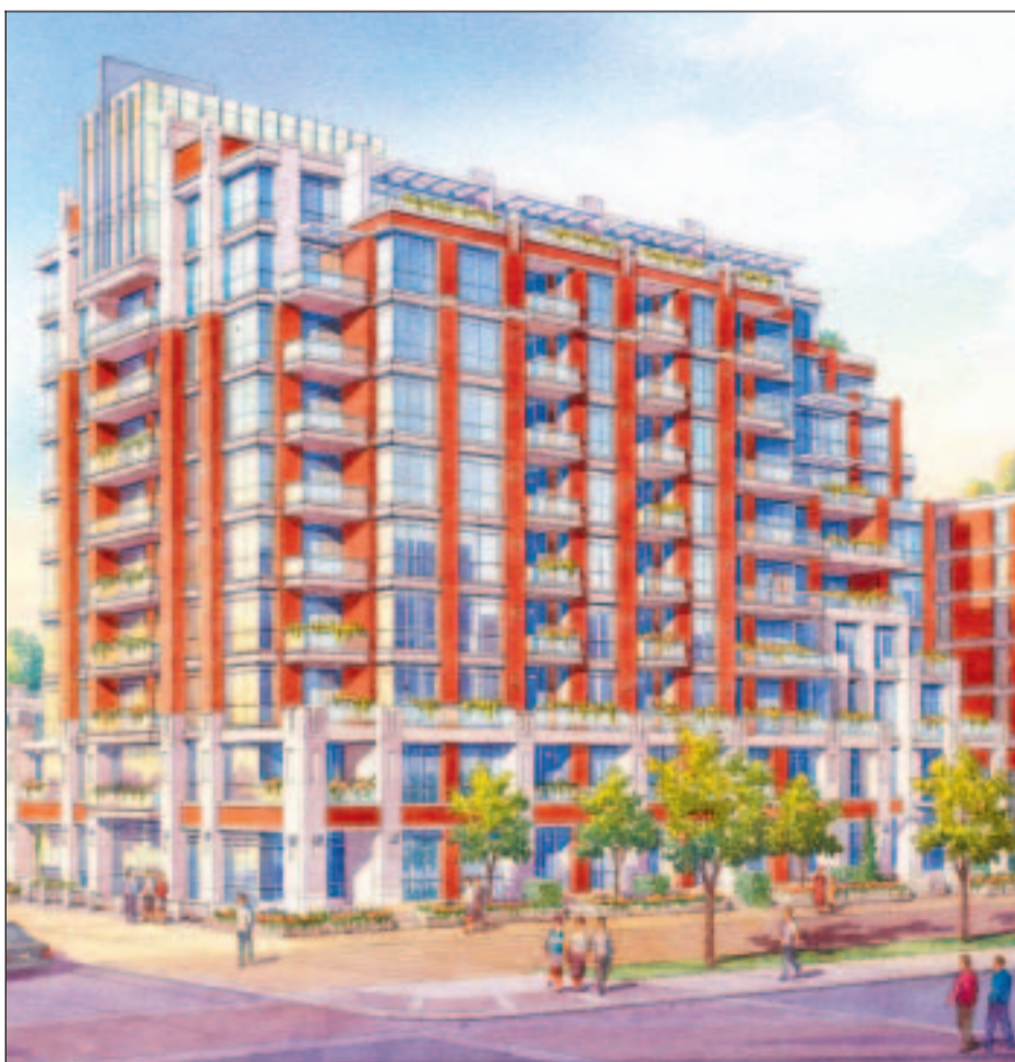
The first building of the Rouge Bijou condominiums will open for sales next month. It will be 10 storeys and have 105 units priced from the $170,000s to the $400,000s.

Three factors to consider with pressure washers. N10