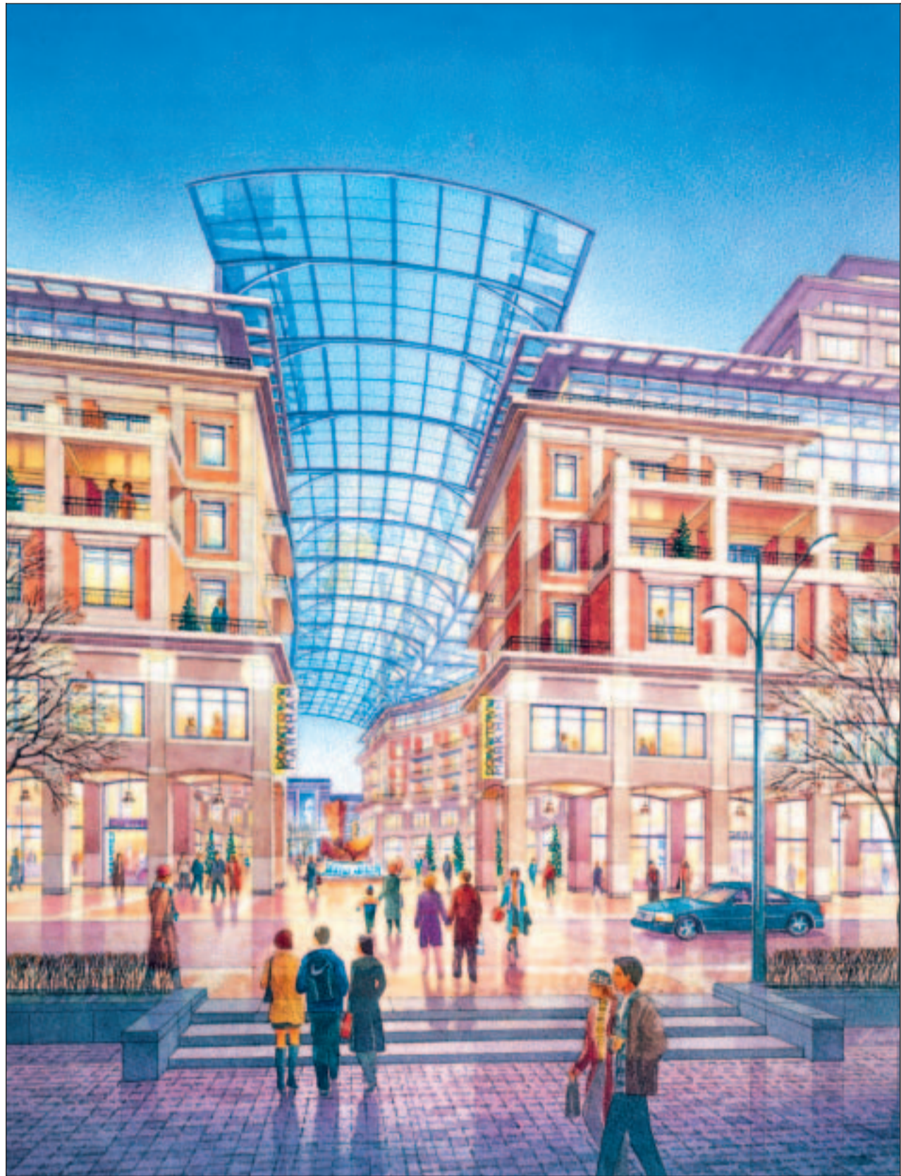
The Gallery in Downtown Markham will link the central piazza and the downtown entertainment district. It will be lined with shops and overlooked by condominiums. The new community will eventually create 16,000 jobs.