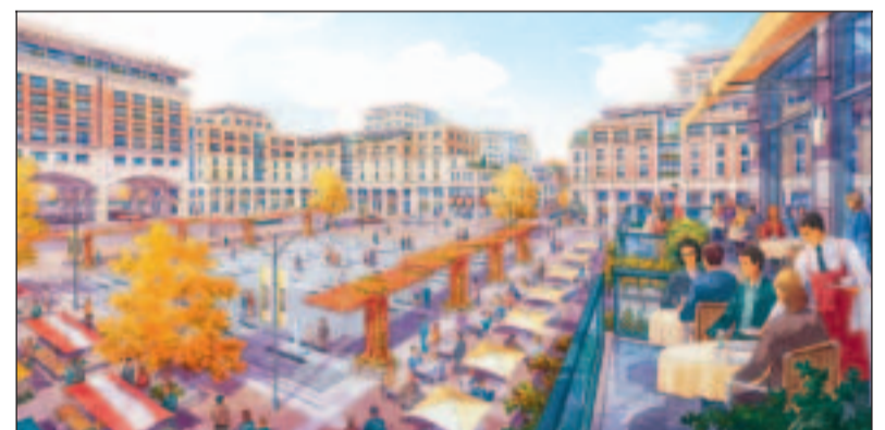
The Piazza will be a European-style square in the centre of Downtown Markham where people can meet and watch or take part in events.